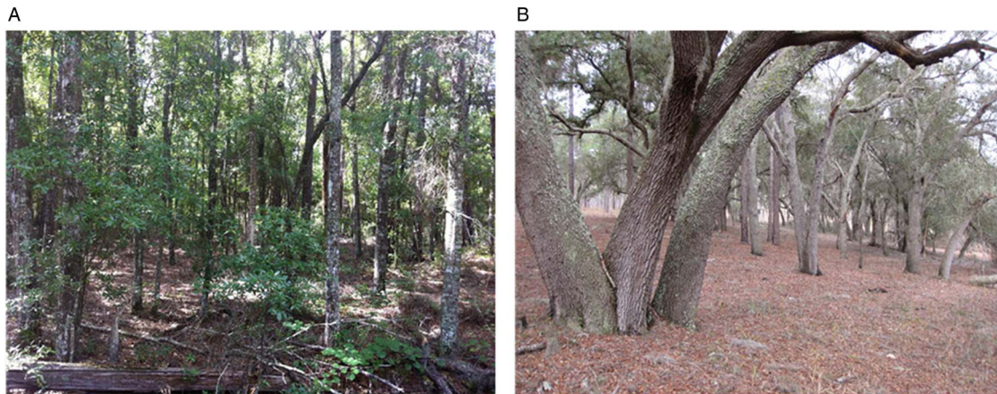
Fig. 1. Habitat types where ticks were collected in OSBS: (A) successional hardwood and (B) xeric hammock.

suggested as a mitigation strategy for ticks, so we also sought to test whether tick behaviour differs between habitats with varying burn history (Davidson et al. , 1994; Willis et al. , 2012; Gleim et al. , 2014). Although extrinsic factors of the environment play a large role in tick-questing behaviour, intrinsic factors such as pathogen infection also influence host-seeking behaviour (Benelli, 2020). However, few studies address the joint effects of habitat type and infection status on questing behaviour in A. americanum .